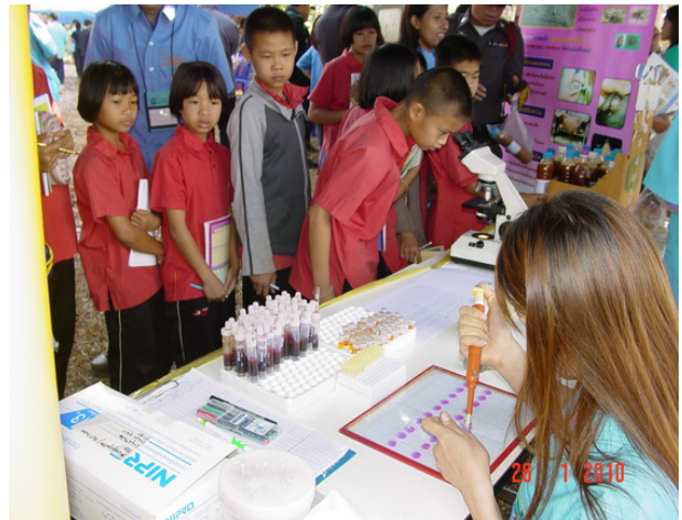
Figure 7-2. Activities of the Royal Thai Veterinary Project