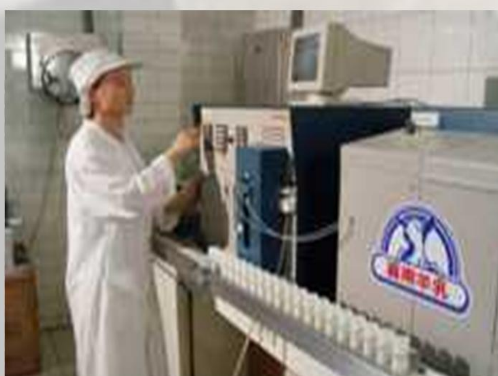
Composition analysis of goat milk