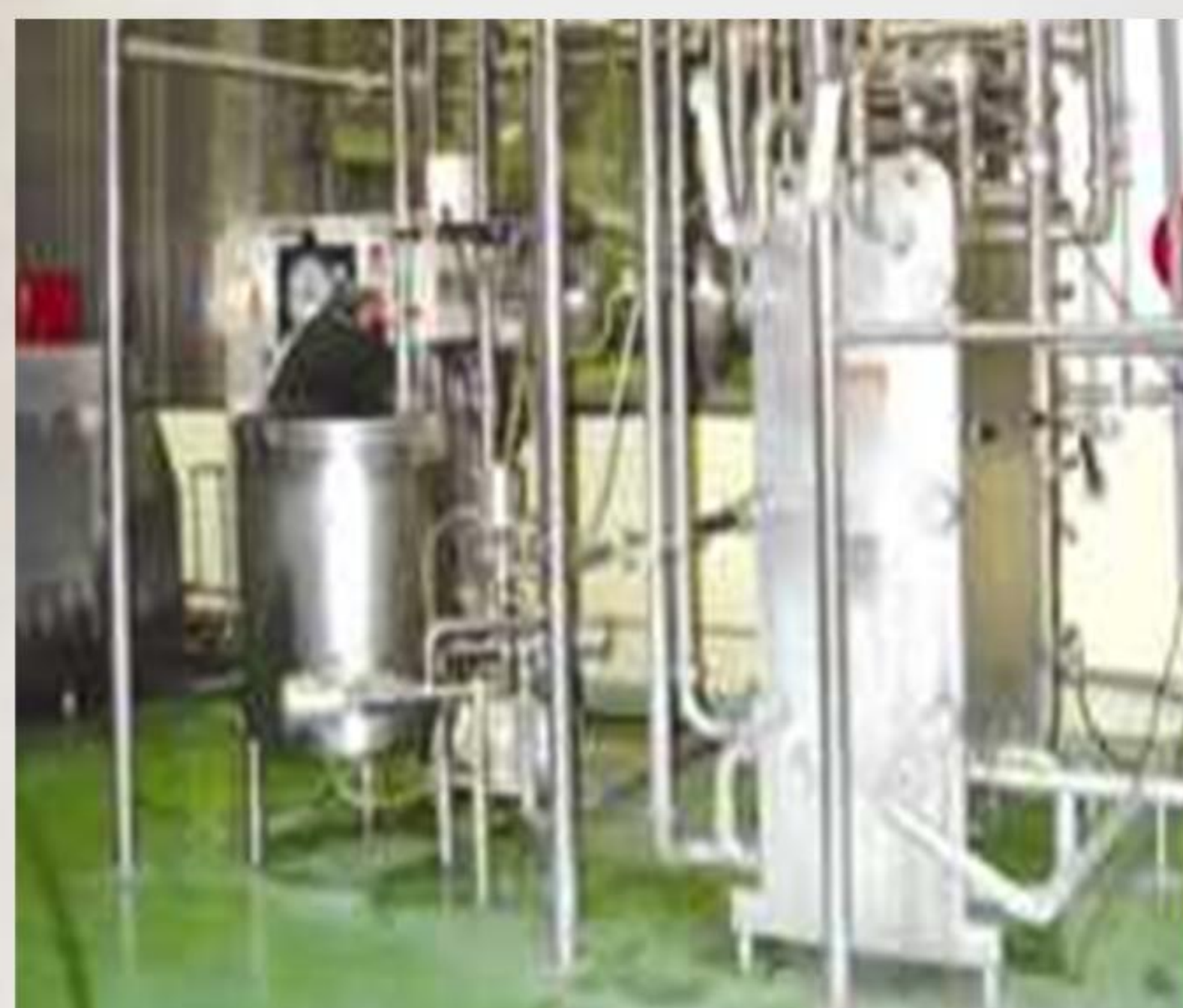
Milk pasteurized by HTST