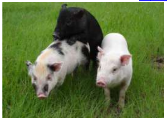
Minipig breeds selected for laboratory use.

AAALAC website: http://www.aaalac.org/index.cfm